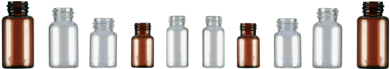
Tubular Type I glass diagnostic/screw neck vials

Tubular glass vials manufactured by SCHOTT from SCHOTT Fiolax® neutral Type I glass tubing. Vials can be manufactured to your precise specification for viable production runs